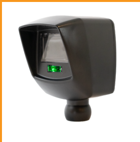
Integrated Sensor Hood