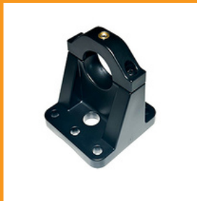
Ball & Socket Mounting Bracket