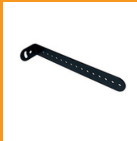
Reflector Extension Bracket